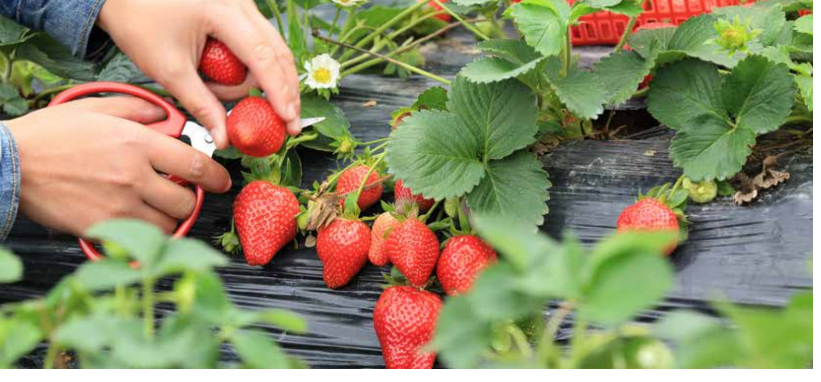
For the gardener, there are very few things more rewarding than eating berries freshly picked from the garden.

different parts of the country, while others are more or less resistant to various diseases, so trying a few different types makes sense. Plant your strawberries according to Grandma's wisdom, when the fruit trees begin to leaf out. Strawberries grow well in compost-enriched soil with a pH of around 6.5. The rhizomes, also called runners, will develop and produce "daughter" plants, which is a good thing because even though they are perennials, the mother plant will not produce well after several years. However, you still want your strawberry patch to remain from year to year, with a few modifications. For strawberries to reward you with a prolific patch over many years, you allow the "daughters" to grow, and you'll want to remove the older "mothers" on a rotation. If you plant in a square pattern and guide which daughter you will nurture, it is easy to keep track of the generations and which