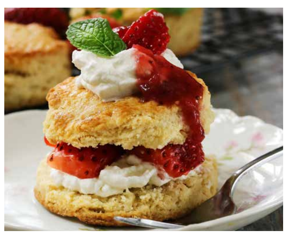
From smoothies to strawberry shortcake, strawberries are a summertime favorite for their sweet, refreshing flavor.

As my young daughter and I strolled through our local nursery on a chilly spring morning, she made a