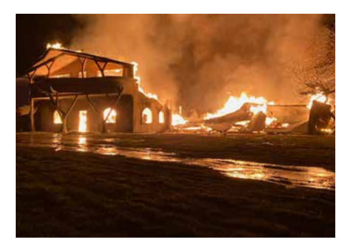
Azure Standard Headquarters burned to the ground in April.

This turnaround time was a couple of weeks longer than we hoped because so many products were affected. In the meantime, we had trouble tweaking our software to show what was out of stock because our system 'knew' we had the bulk product; however, it was not yet poured or packaged for sale. We apologize for the confusion and inconvenience this may have caused you as you tried to place orders. By the time we go to press with this letter, all our liquids should be available for purchase again.